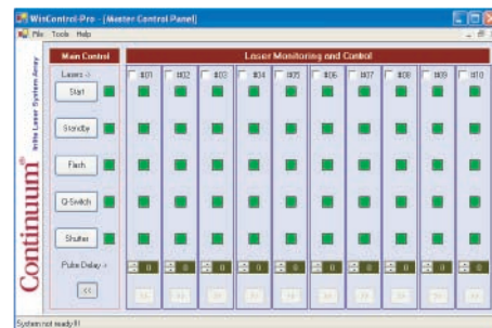
Custom Graphical User Interface

laser as well as setting the timing of the system through a single control panel. One button can enable the entire system for ease of operation.