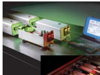
Surelite™ OPO Plus

The TCU-1 is the perfect choice to accurately synchronize any series of optical events.