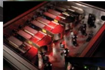
500 Hz System